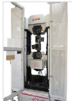
Tensile Test 100T