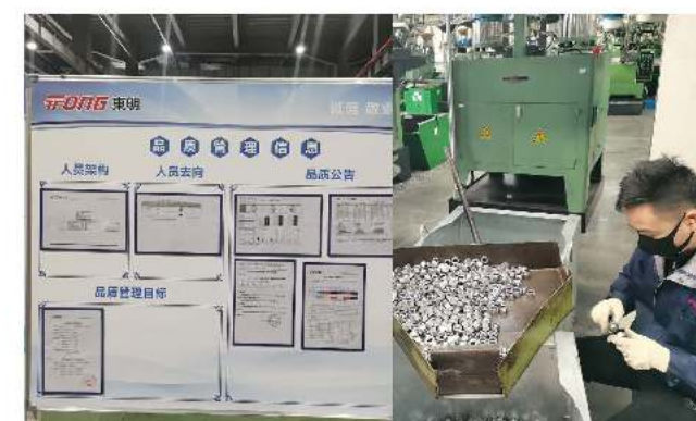
Internal and external audits proactively improve our systems