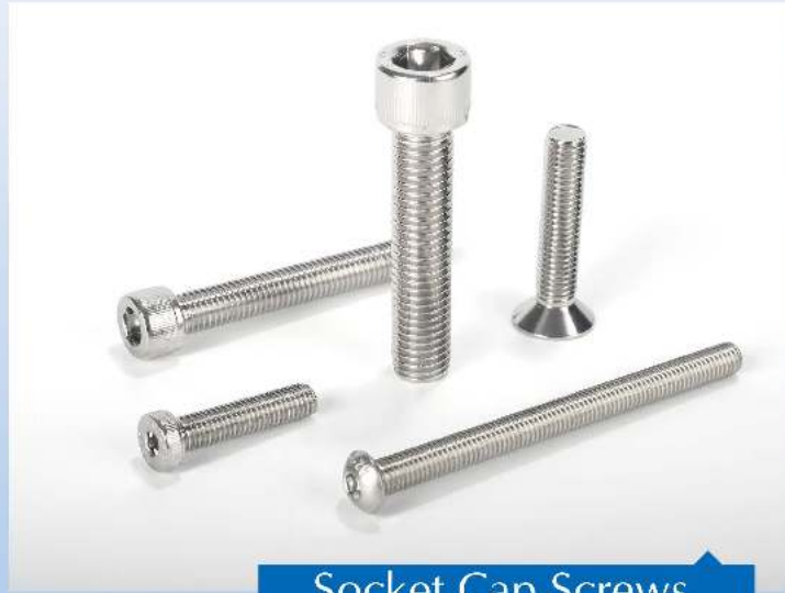
Socket Cap Screws