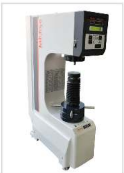
Rockwell Hardness Tester