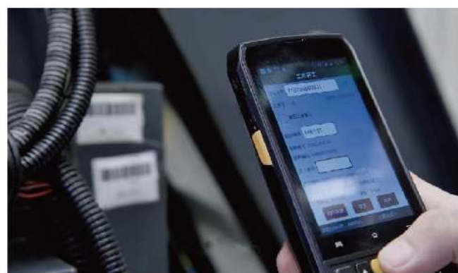
Manufacturing Execution System (MES) ensures material, machine and work order are correct.