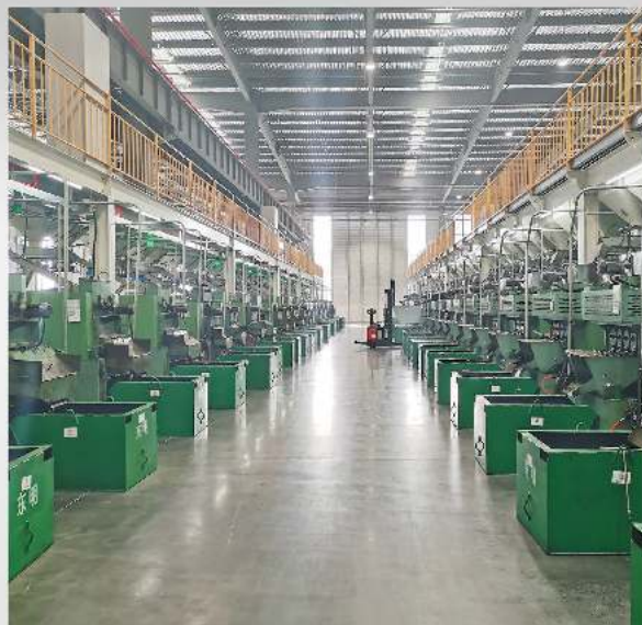
THREADING / TAPPING