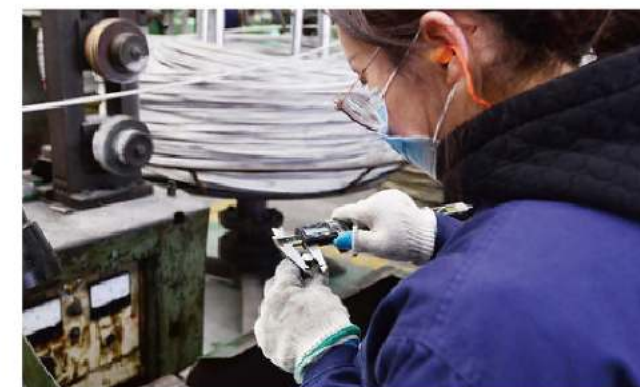
Frequent spot checks by both production and QC workers