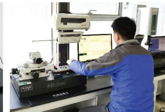
Contour Measuring Instrument