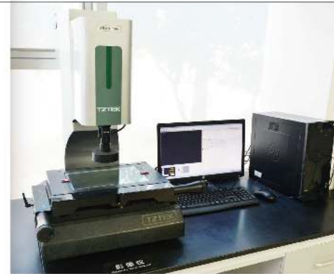
Stationary Metal Analyzer