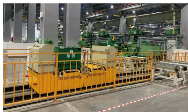
Fully Automatic RGV delivery avoids mistakes and shortens hand-offs