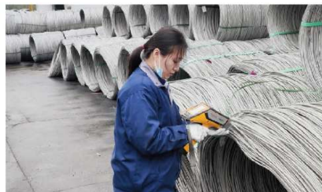
Incoming material inspection to validate steel mill's certificate

Preventing defects and errors lowers cost and speeds production.