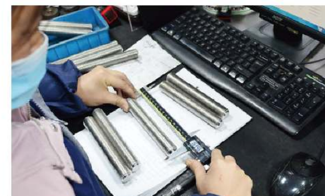
Visual and mechanical final inspections