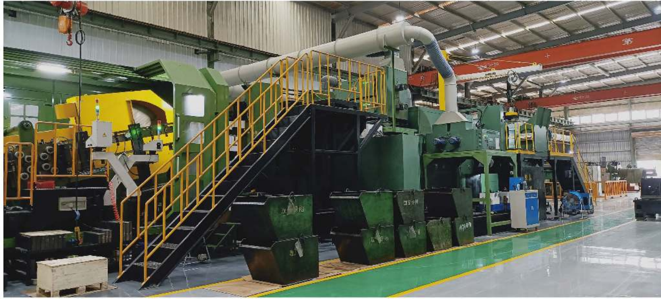
Large bolt cold forming machines up to M36 and 1-1/2"