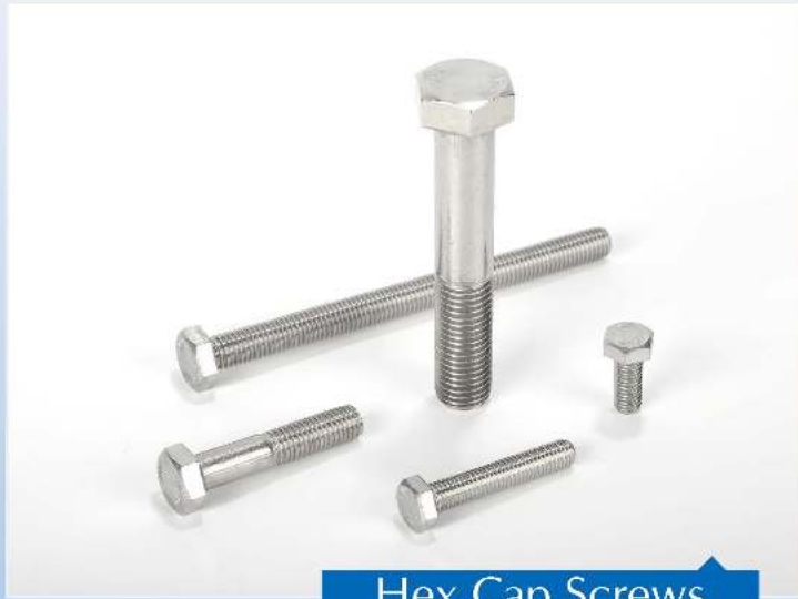
Hex Cap Screws