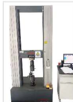
Tensile Test 30T