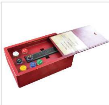
Low Mu Permeability Indicator