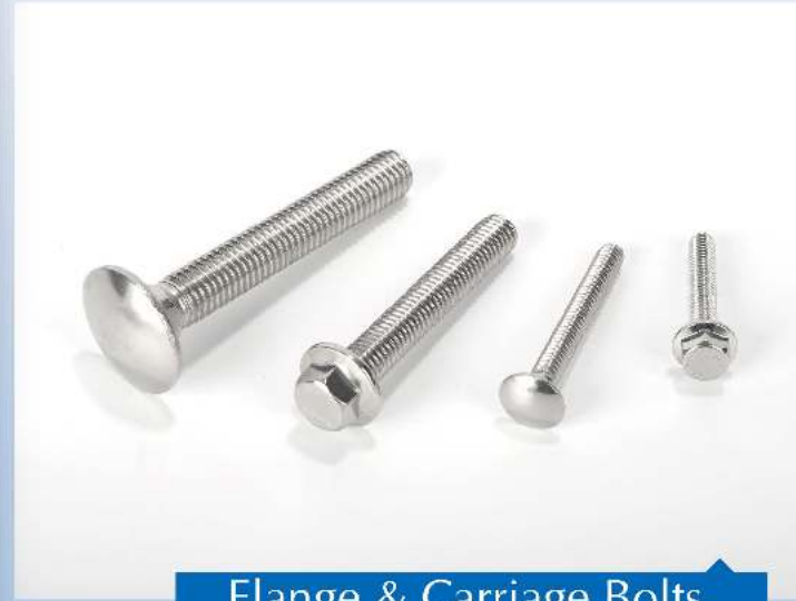
Flange & Carriage Bolts