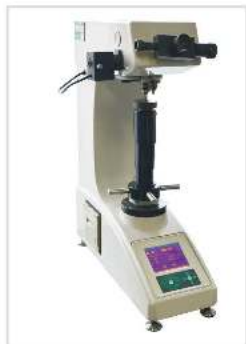
Vickers Hardness Tester