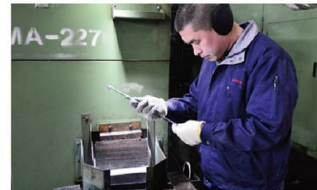
First piece inspection enforced by MES