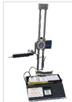
Surface Roughness Measuring Instrument